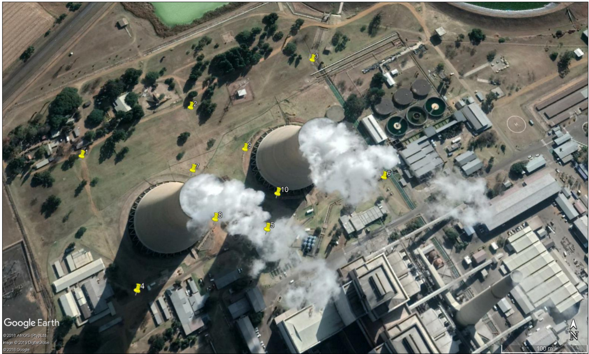
Figure 1: Site Coordinates for the proposed development footprint on the Northern Cooling Towers at the KPS.